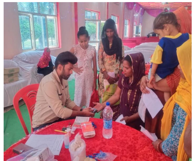
Lab Check-up Counter – Blood Sugar & Haemoglobin Test