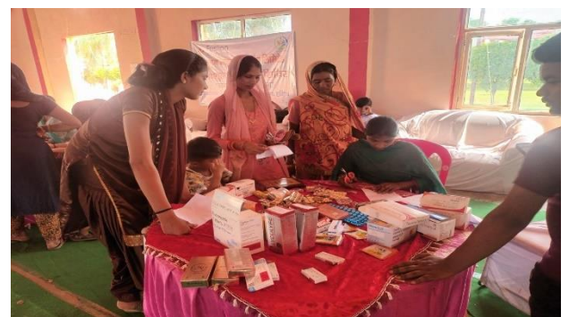
Medicine Distribution Counter