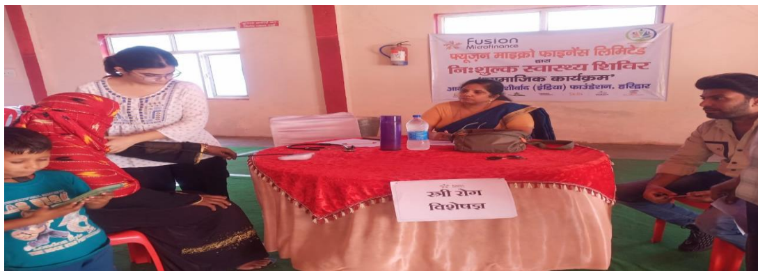
Lab Check-up Counter – Blood Pressure Test