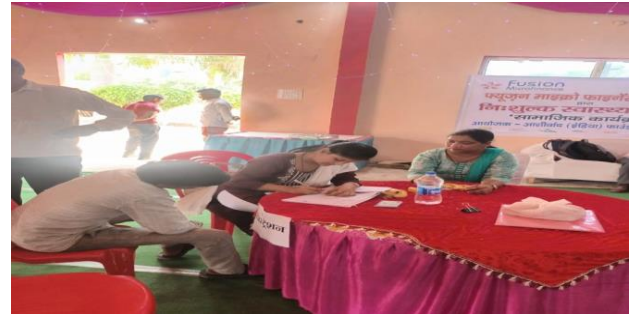
Patients at Registration Counter