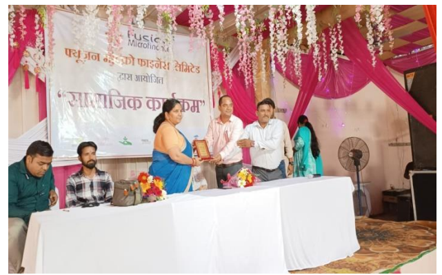
Welcoming Pics of Guests